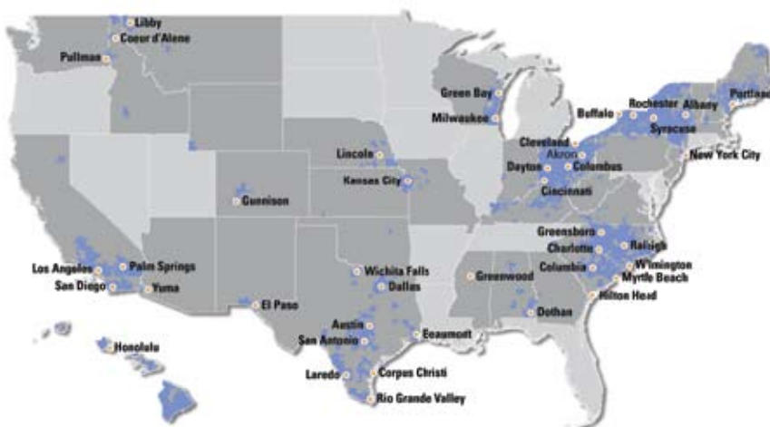
Services are not necessarily available throughout the shaded areas. Services are available only in the indicated metropolitan areas of the shaded states.